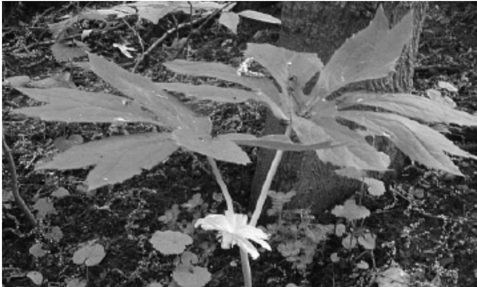
May Apple