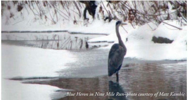
Blue Heron in Nine Mile Run

NON-PROFIT ORG US POSTAGE PAID PITTSBURGH, PA PERMIT NO. 23