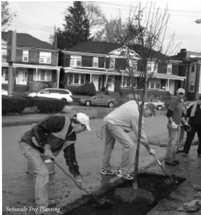
Swissvale Tree Planting